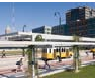
This photo of the Fifth Street Pedestrian Plaza Bridge by Georgia Institute of Technology's media photographer depicts daily campus hustle and bustle.