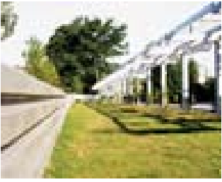
Georgia Institute of Technology is responsible for maintaining the landscaping on the Fifth Street Pedestrian Plaza Bridge in Atlanta, Ga.