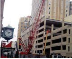
Construction was possible from only one side of the 915 Walnut Street Parking Structure in downtown Kansas City, Mo.