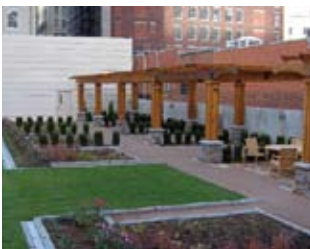
A 16,000 ft 2 rooftop garden, the largest elevated garden in Kansas City, Mo., gracing the top of the seven-level 915 Walnut Street Parking Structure.

The crown jewel of the facility is its rooftop garden. Additional loading was calculated and provided by IPC, the precaster, to ensure components would support the added soil and plants and the added load as the trees and landscaping mature. Eight-inch double tees were used to meet this need. The project also called for columns, ledge beams, precast stairs, spandrels, wall panels and shear walls.